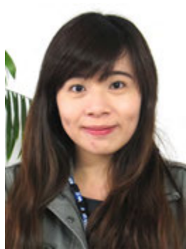
7 th -Year: Taipei Medical University

I thought all the people I met at Showa University were incredibly nice and welcoming - from the IEC to the physicians and staff to the other students...It has been a privilege working with them, and I can only hope that I will be as committed as they are.