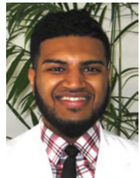
6 th -Year: Albany College of Pharmacy and Health Sciences

People in Showa are very kind and willing to help.