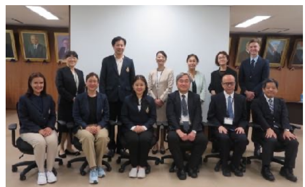
WALAILAK UNIVERSITY SCHOOL OF PHARMACY