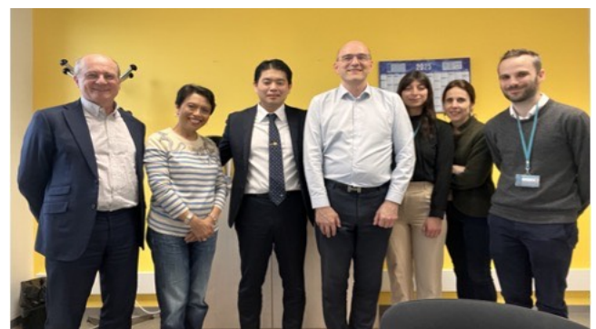
LYON 1 UNIVERSITY