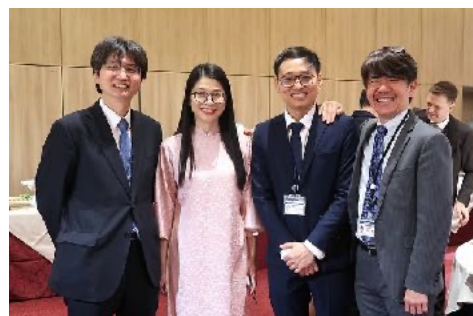
INTERNATIONAL FELLOWS AND FACULTY SPONSORS

For the rest of this academic year, these 12 international research fellows will continue to devote themselves to study and research in their respective departments and labs at Showa Medical University. At the end of the academic year, a Certificate Award and Farewell Party will also be held for our international research fellows to celebrate their successful completion of the International Postgraduate Program and to receive their official certificates from our university's president.