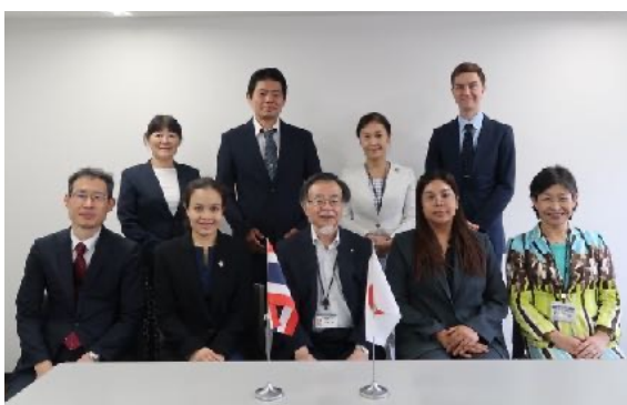
WALAILAK UNIVERSITY SCHOOL OF MEDICINE

On July 31, 2025, The School of Pharmacy welcomed four representatives from Walailak University School of pharmacy. They met our dean and head of the international exchange committee from the pharmacy school, and other faculty. Although a short visit, it was an important first step toward future possible exchange between our schools.