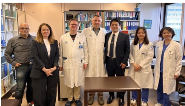
MEDICAL UNIVERSITY OF VIENNA

Moving forward, we will continue to expand opportunities for international learning and collaboration for both students and faculty and work to enhance practical international education.